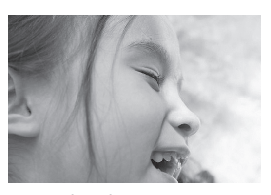
Saskatchewan Foster Families Association 2012 Second Edition Handbook