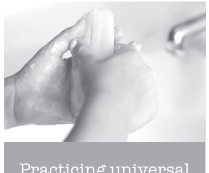
Practicing universal precautions can reduce the risk of disease.

• Use disposable latex gloves when handling or cleaning up blood and/or other body fluids. Household rubber gloves can be used, but they need to be cleaned with a bleach solution and